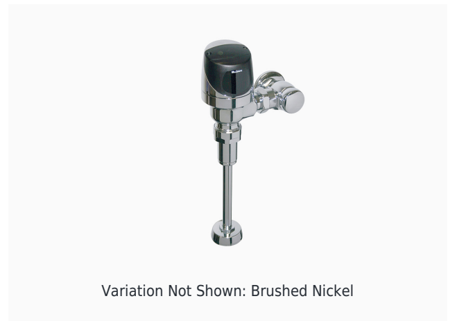
Variation Not Shown: Brushed Nickel